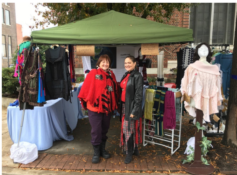
Earth Out Recycled Textile Designs